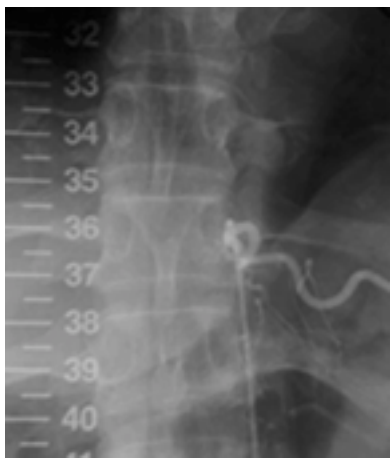
Angiogram Picture showing filling of an Intercostal Artery

YOU WILL BE ASKED TO SIGN A CONSENT FORM TO SAY THAT YOU UNDERSTAND THE RISKS . IF YOU ARE NOT SURE ASK BEFORE YOU SIGN.